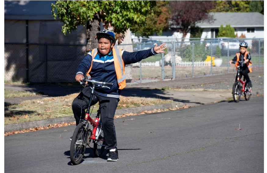
Safe Routes to School Program Impact 2019-2021